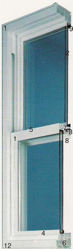
ULTRA SINGLE-HUNG DESIGN